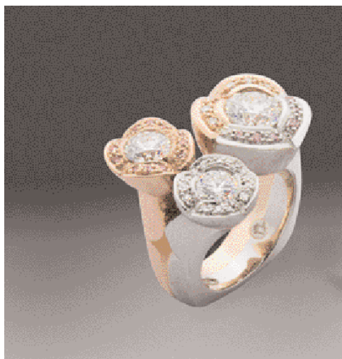
Hand in Hand